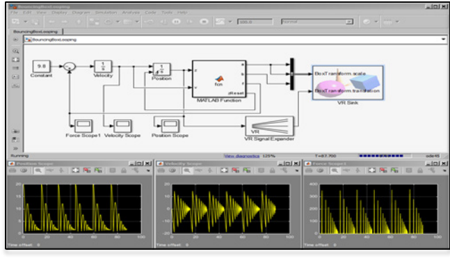
Figure 4 : Block Diagrams of Simulink Implementation with Plotted Position, Velocity, and Force Variation of Cube.